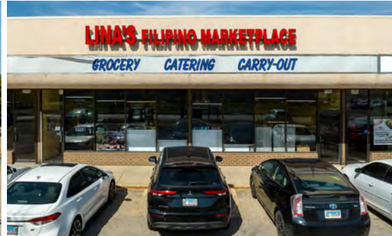
TYLER CREEK PLAZA 2-80 TYLER CREEK PLAZA, ELGIN, ILLINOIS 60123