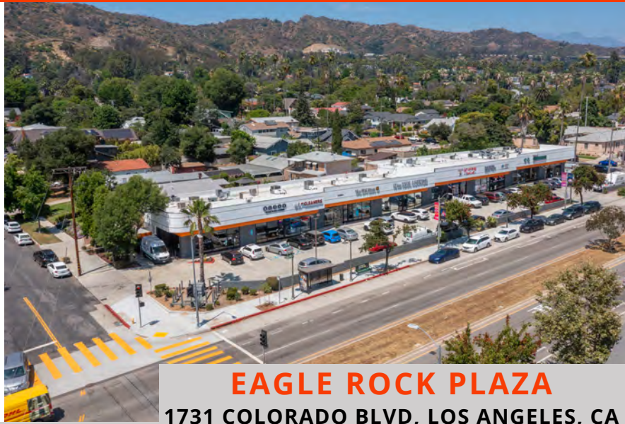
EAGLE ROCK PLAZA 1731 COLORADO BLVD, LOS ANGELES, CA