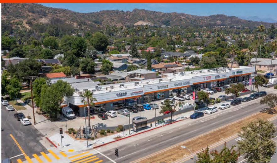
EAGLE ROCK PLAZA 1731 COLORADO BLVD, LOS ANGELES, CA 90041